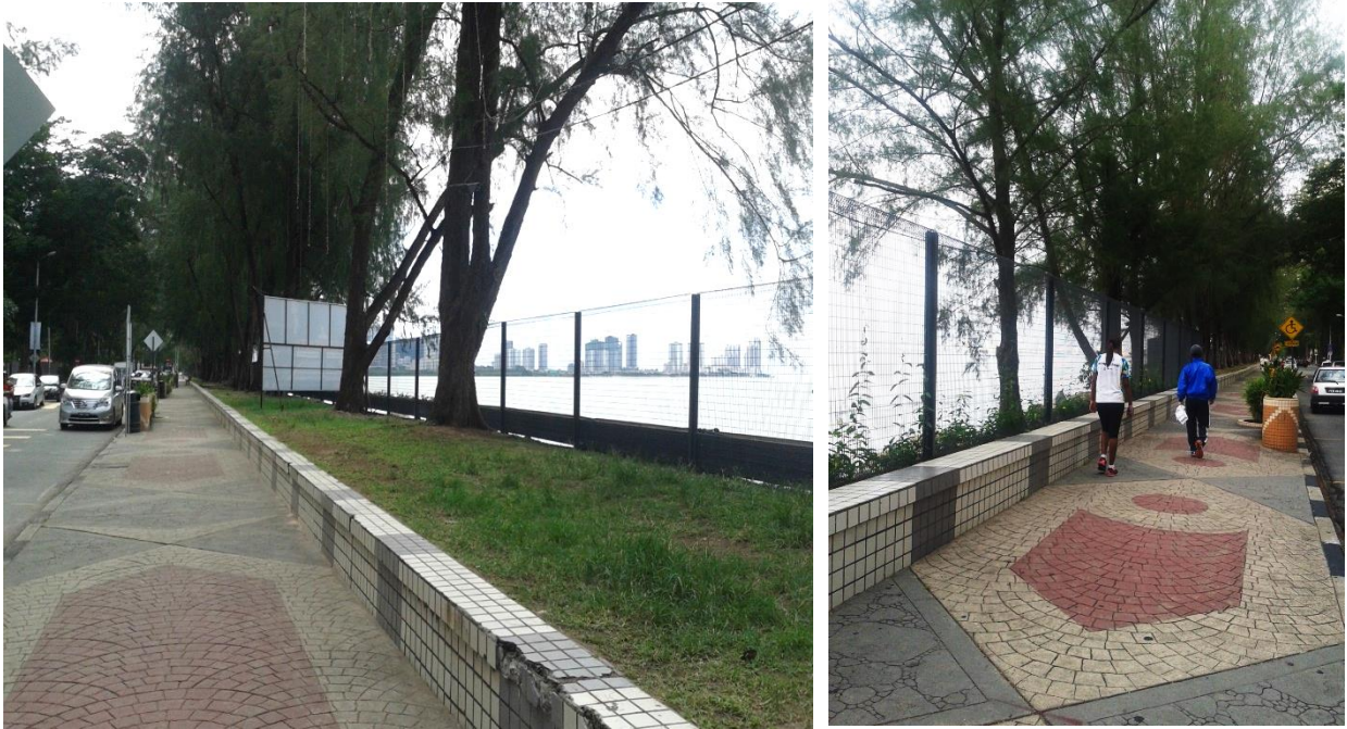
Completed fencing with existing casuarinas maintained and walkway open to public access