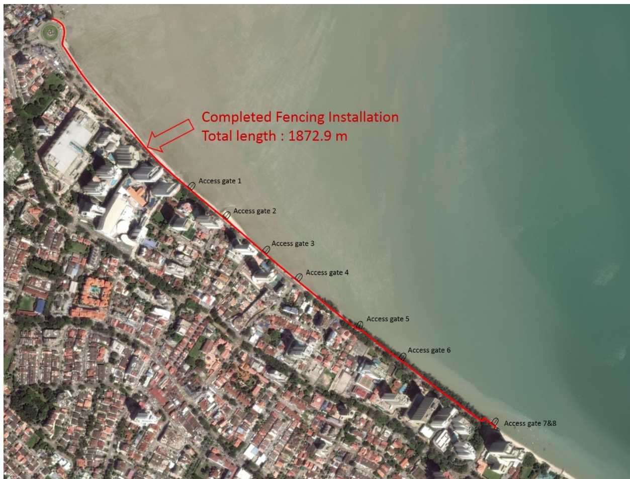
Aerial view of completed fencing installed along Gurney Drive

The 1872.88 metres of fencing with planter boxes along Gurney Drive is now fully completed with the entire stretch along the promenade cleared of barricades, enabling members of the public to enjoy the approximately 2-kilometre length of the existing Gurney Drive walkway.