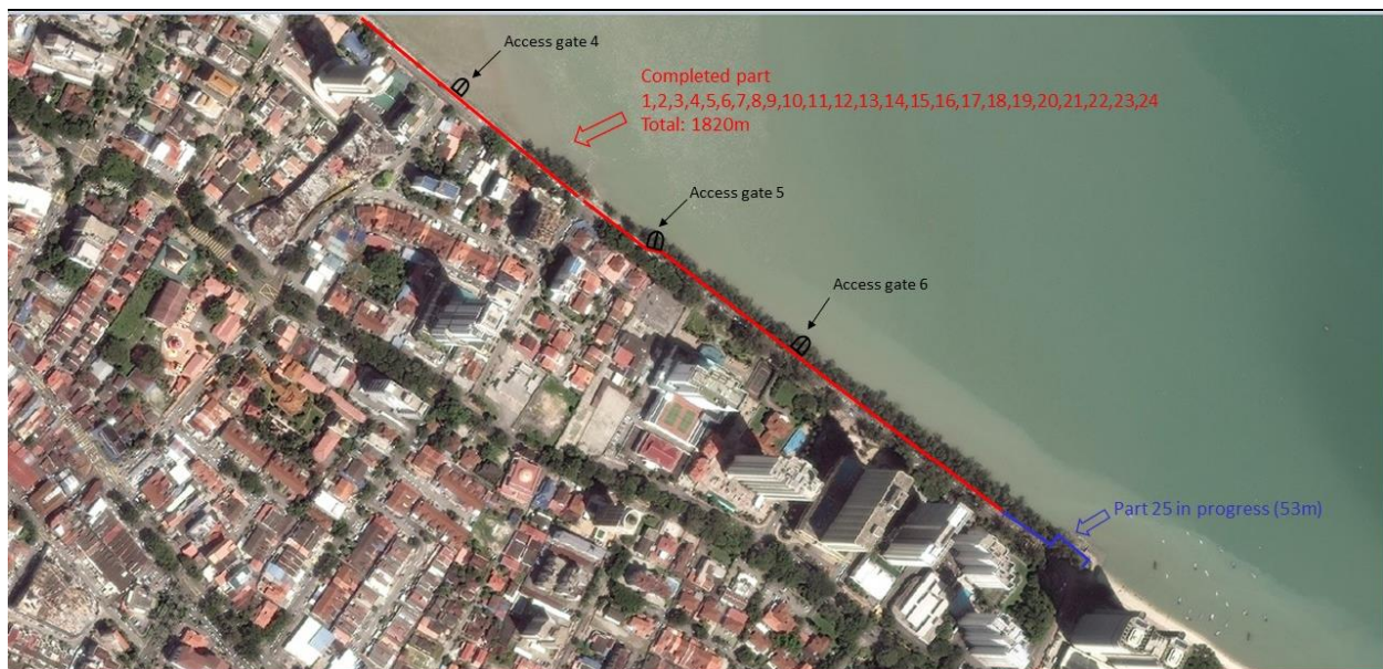
Aerial view of fencing works progress

The developer assured that once the fencing works are fully completed, the whole 2-kilometre stretch of the existing promenade walkway will remain open for the public's continued access and enjoyment of the sea view. The public are already currently able to access the earlier completed sections. Installation work is expected to be fully completed by the end of this month.