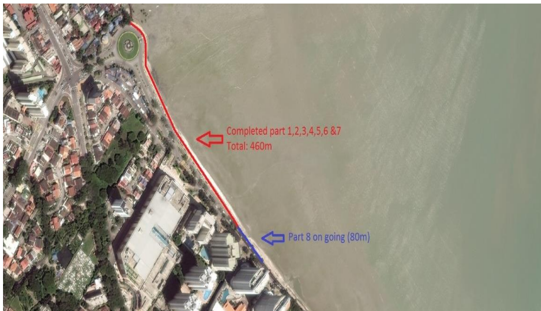
Aerial view of fencing works progress

Since the third update, fencing works have progressed to cover approximately 23 percent of the total 2 kilometres to be fenced. Works at the first seven sections covering 460 metres have been fully completed and are in progress at the latest 80-metre section. As per authorities' requirements, the 80-metre stretch where works are on-going have been barricaded for public safety.