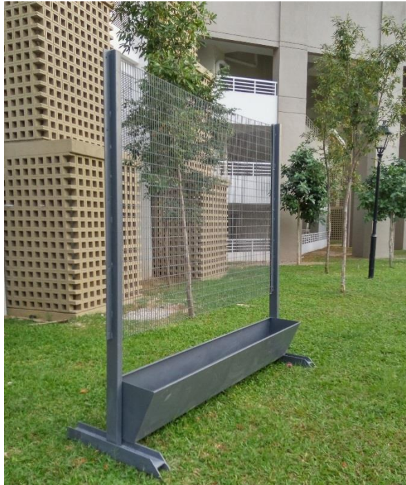
Prototype fabrication fencing and planter box