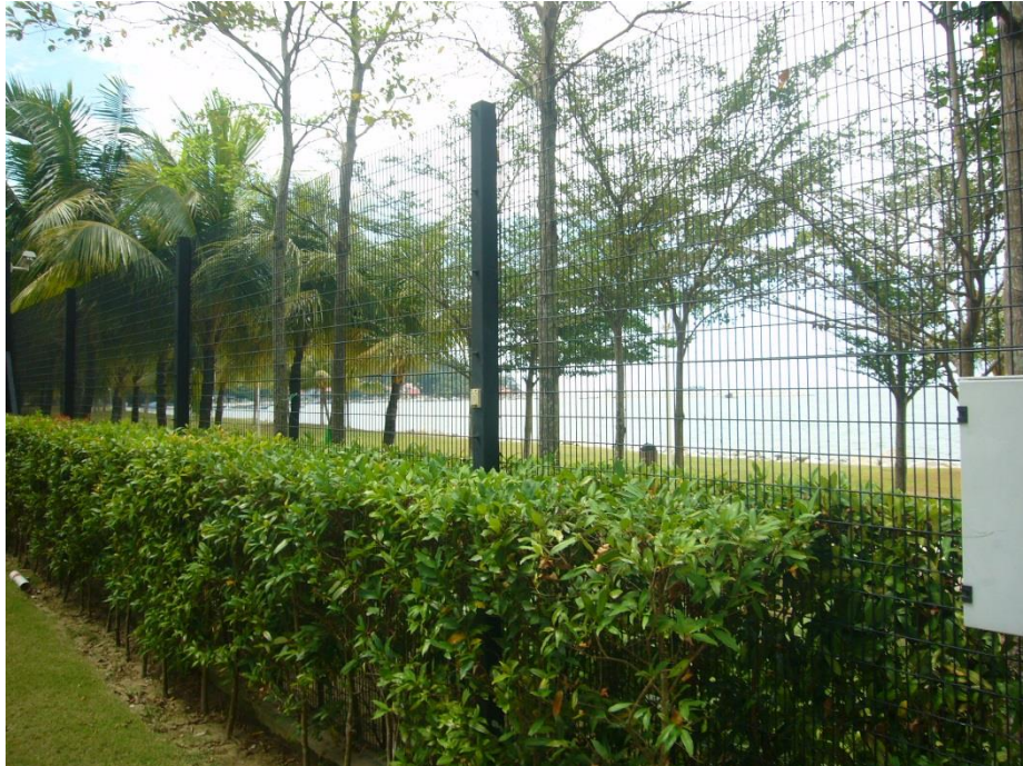
Actual fencing at Quayside Seafront Resort Condominiums, Penang