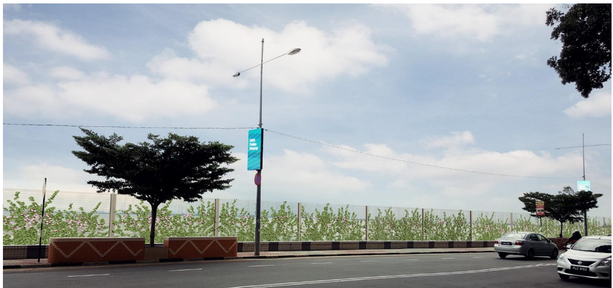
Artist's impression of the specially-designed permeable mesh fencing along Gurney Drive for the public to continue enjoying the sea view and breeze.

TPD will continue to keep the public informed by providing periodic updates for the duration of the fencing installation process.