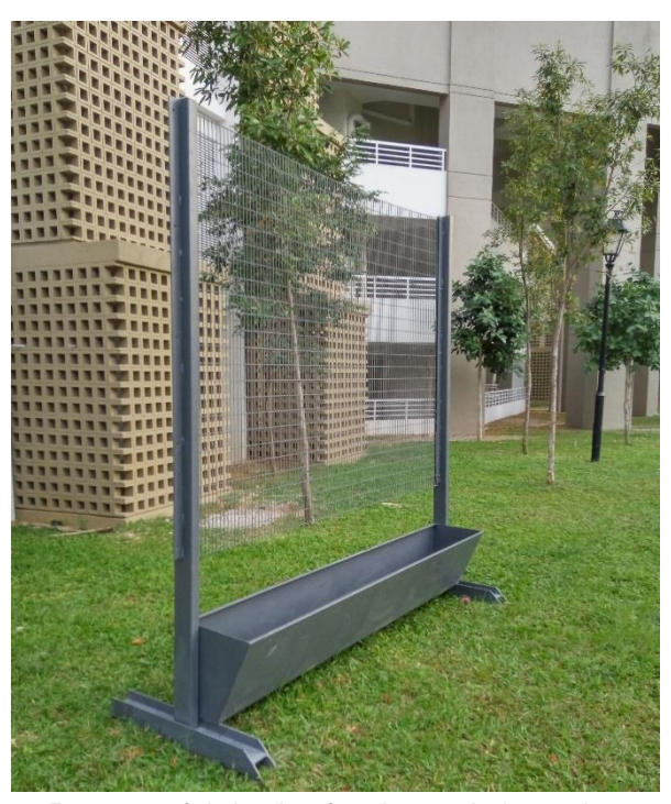
Prototype fabrication fencing and planter box