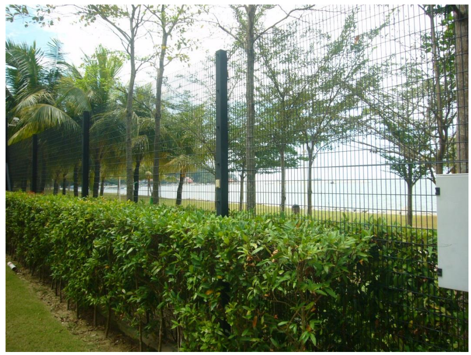
Actual fencing at Quayside Seafront Resort Condominiums, Penang