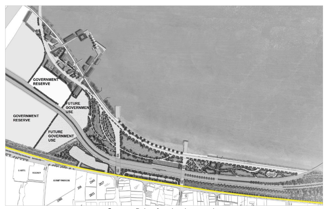
Gurney Drive fencing layout plan