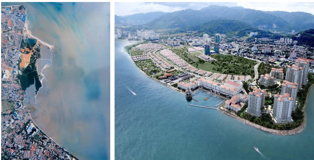
Left: The partially reclaimed site in 2001;

All these steps were taken to allow the general public to have the opportunity to be aware, understand, comment and participate in this project.