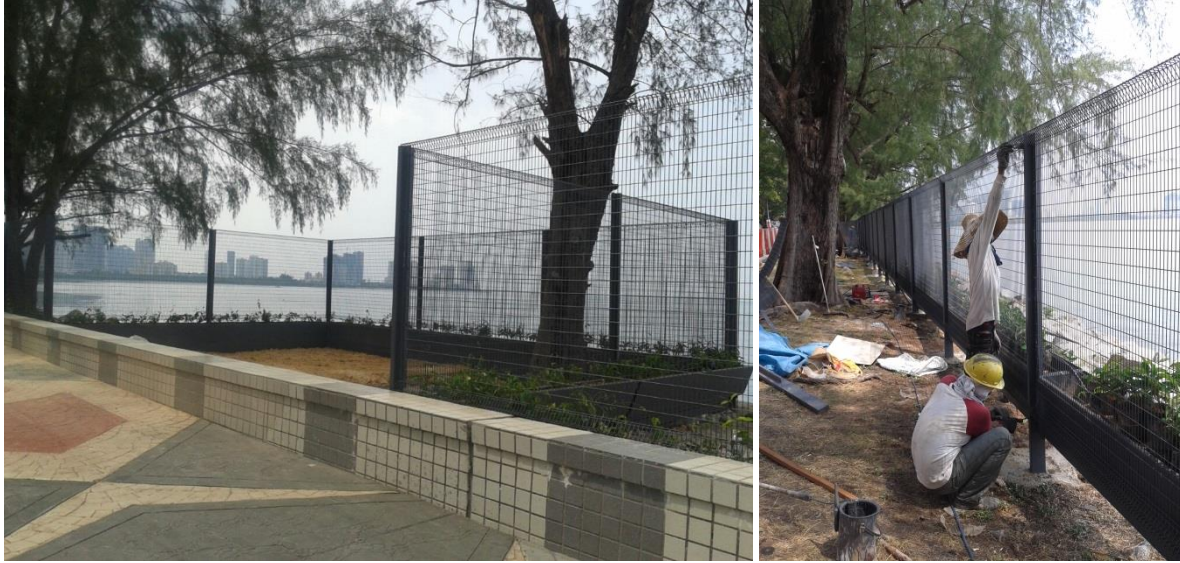
Two photos above show the fencing works that have extended beyond the casuarina trees as an effort to enable continued access to the trees, as well as maximise pedestrian space on the grass verge.

The developer has also installed four access gates along the fencing to enable access to city council workers for maintenance of the plantings behind the fencing and cleaning of the coastline. These gates are kept locked at other times for public safety.