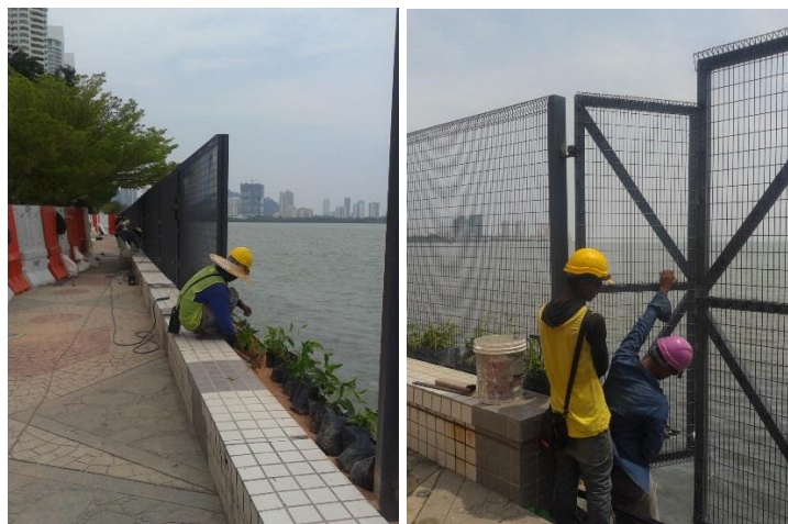
(Left) Workers planting the creepers; (right) Workers securing the access gates.

Since the last update, 1,180 metres of metal structure works involving the installation of the fencing poles, mounting of planter boxes and installation of mesh material have been completed. At the section where work is in progress, 18 fencing poles are currently being installed whilst all planter boxes have been mounted.