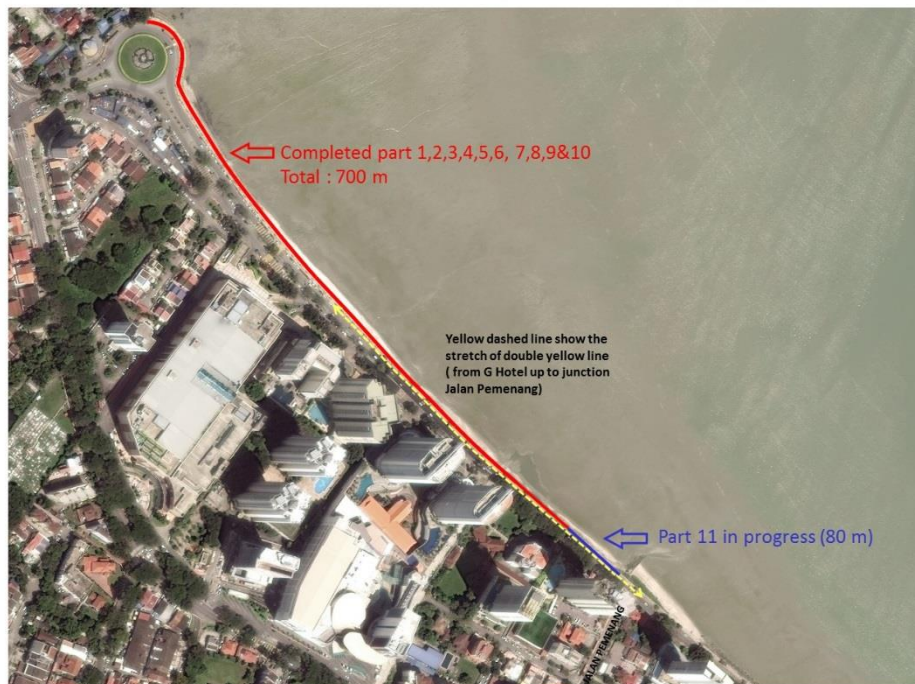
Aerial view of fencing works progress

Fencing installation works which started a month ago have since advanced to cover roughly 35 percent of the total 2 kilometres to be fenced. Nearly 700 metres across 10 work sections have been fully completed while works are in progress at the latest 80-metre section. The 80-metre stretch where works are on-going have been barricaded for public safety, in line with authorities' requirements.